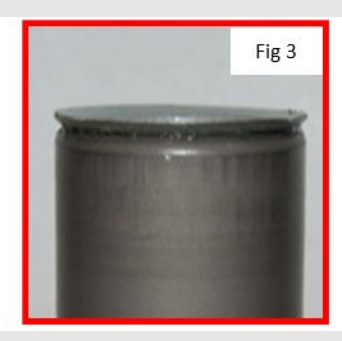
The piston retaining ring has deformation or rippling. This shows that the cylinder has been overstroked.