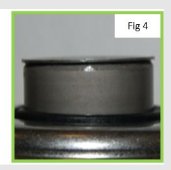
The piston retaining ring has no deformation or rippling. This shows that the cylinder has not been overstroked.